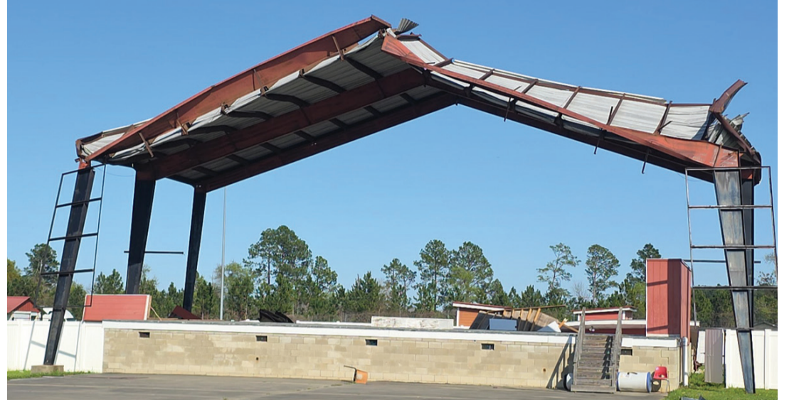
Big Pig Jig stage with twisted frame and blown out backing.

The Chamber of Commerce and the Big Pig Jig® organiza-