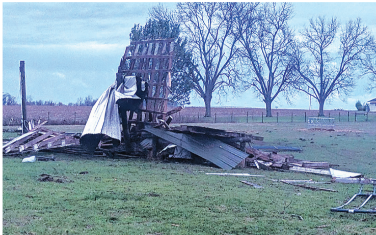
A storage building destroyed in the Unadilla area.