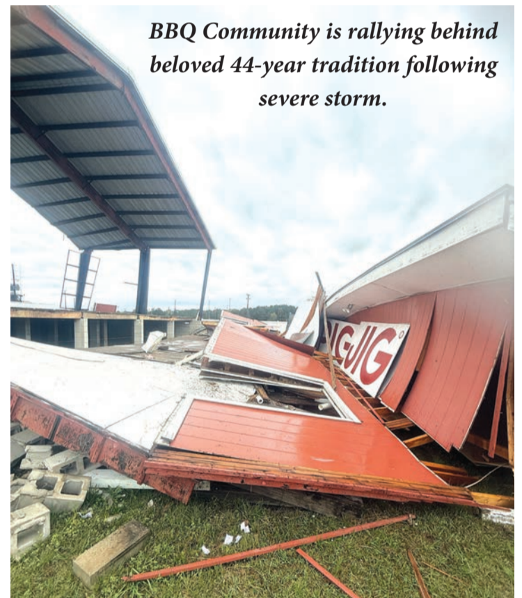
BBQ Community is rallying behind beloved 44-year tradition following severe storm.